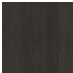
Veneered wood Coal oak