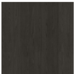
Solid wood Coal oak

Materials, fabrics, leathers, colors and finishes are approximate and may slightly differ from actual ones. You can find the complete collection of Bonaldo fabrics and leathers on the website https://bonaldo.biz