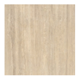
Marble Travertino Romano

Materials, fabrics, leathers, colors and finishes are approximate and may slightly differ from actual ones. You can find the complete collection of Bonaldo fabrics and leathers on the website <a href="https://bonaldo.biz">https://bonaldo.biz</a>