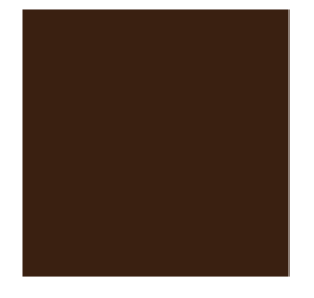
Lacquered wood Mat bronze