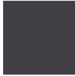
Painted metal Supreme anthracite