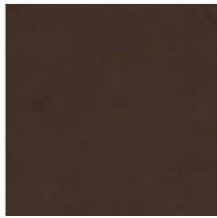
Painted metal Mat bronze