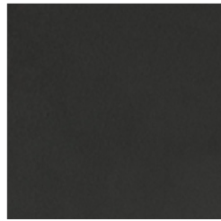
Painted metal Mat lead