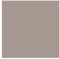
Painted metal Mat dove grey