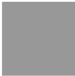
Metal finish Clouded chrome