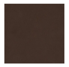
Painted metal Mat bronze