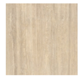
Marble Travertino Romano