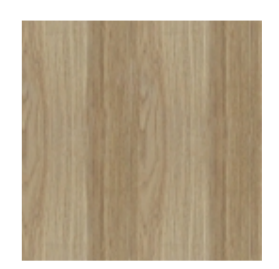
Veneered wood Brushed Grey oak