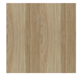
Veneered wood Brushed Grey oak