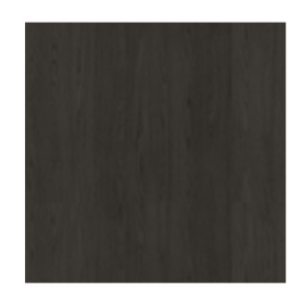
Veneered wood Brushed coal oak