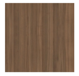
Veneered wood Walnut Canaletto