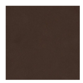
Painted metal Mat bronze