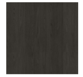
Veneered wood Brushed coal oak