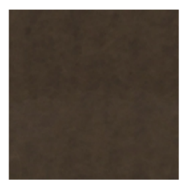
Mat lacquered wood Brushed bronze