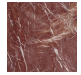
Marble Rosso Carpazi