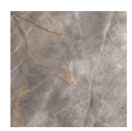
Marble Fior di bosco