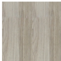
Solid wood Grey ash

Materials, fabrics, leathers, colors and finishes are approximate and may slightly differ from actual ones. You can find the complete collection of Bonaldo fabrics and leathers on the website https://bonaldo.biz