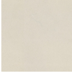
Concrete finish high-density polyurethane